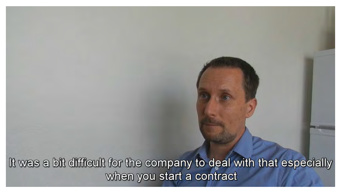
Figure 3. A social worker shares his experience from the field in a video created by the French team 'Association Transfer'

The narrator shares the story of a female employee in a French company (the names of which are not disclosed), who after an initial 'good start' appears as if she has faked sickness. Apparently, according to the narrator, the company makes an 'attribution error' (he uses this psychological term), by failing to recognize the employee's health condition. The narrator goes on to say that the reaction of the employer was to state that 'this person [the worker] doesn't work anymore' (2 min 20 sec), that 'she is not reliable' (3 min 36 sec) and 'if it happens again she will lose her job' (3 min 42 sec). He describes his role in the situation as 'to demonstrate that we can't judge those situations at first sight' [sic] (3 min 25 sec). He explains the emotions of the employee, who probably faces 'a number of practical stressors', like 'caring for dependents, having her sense of self-reliance compromised, acquiring the identity of a sick person', and so on. According to the narrator, the employee 'felt carried' (4 min 25 sec) ... in the procedure to materialize and prove the fact that she is in a situation that she cannot handle' (4 min 29 sec).